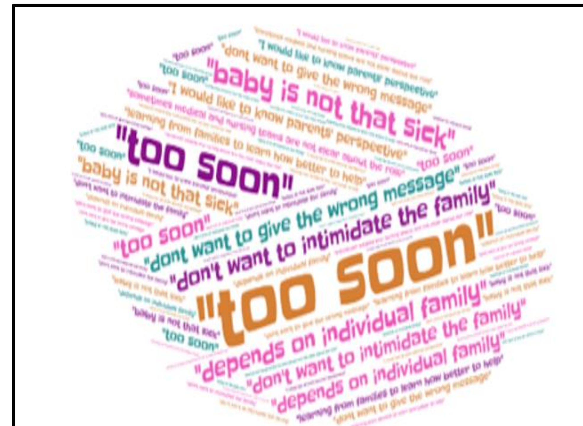
Figure 1. Provider responses to survey