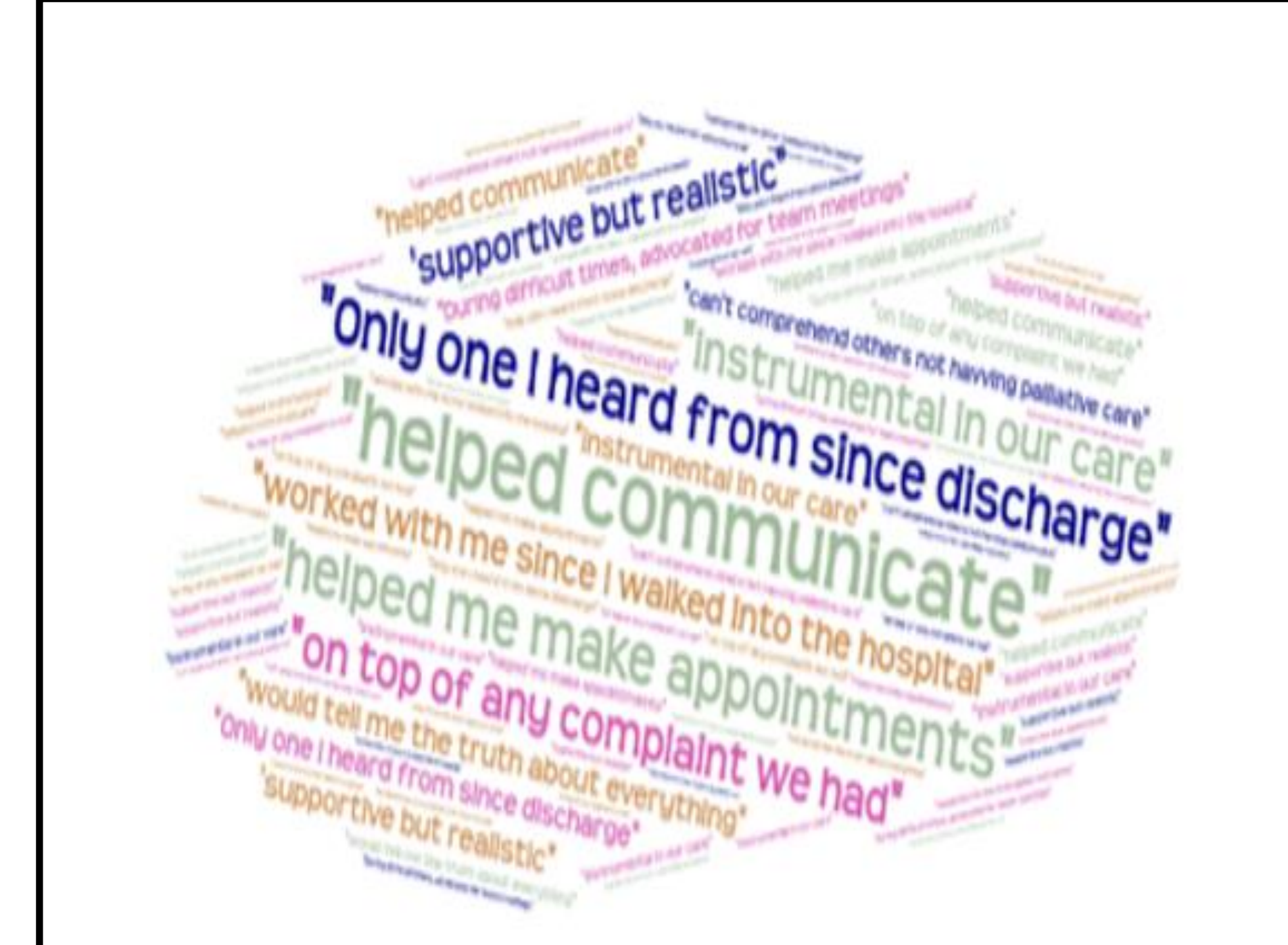
Figure 2. Parent responses to survey