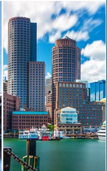
BOSTON Oct. 5-6

We anticipate each symposium will attract more than 100 pediatric nurse practitioners (PNPs), family nurse practitioners (FNPs) and other pediatric providers. Nurse practitioners are an essential part of the healthcare team, interacting with parents, patients and other health-care professionals on a daily basis. These expert healthcare providers evaluate, diagnose and prescribe for newborns through young adults.