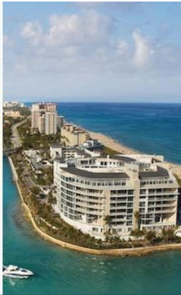
BOCA RATON Aug. 10-11