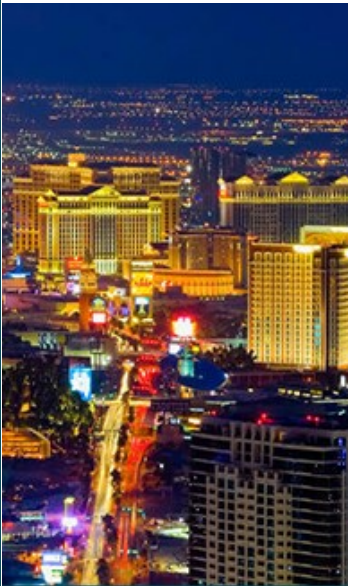
LAS VEGAS Aug. 3