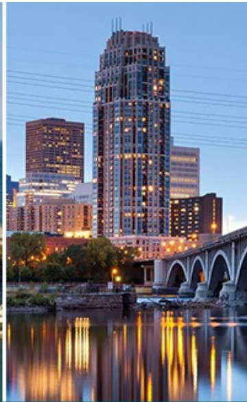
MINNEAPOLIS Sept. 14